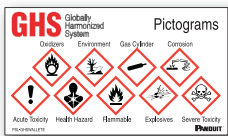
PSL-GHSWALLETE Side 1