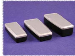
click to enlarge (Group View)