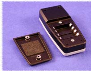
click to enlarge Open View (Bottom)