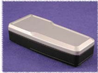
click to enlarge (Assembled View)

Path: Home > Enclosure Index > MOREnclosures > ROLEC - Sealed - Diecast Aluminum HandCase