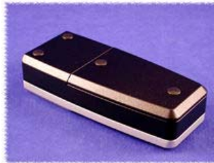
click to enlarge Assembled View (Bottom)