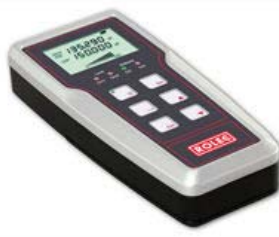
click to enlarge (Application Example)