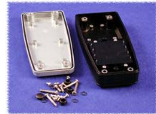
click to enlarge Open View (Top)