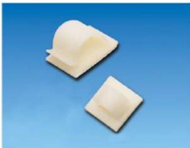
Adhesive clips come in pairs connected together on adhesive liner.

RB self-adhesive clips are ideal for cable and pipe bundles. Bundles are easily snapped into or out of clips. The RB clips suit diameters of 1/8", 5/16", and 1/2".