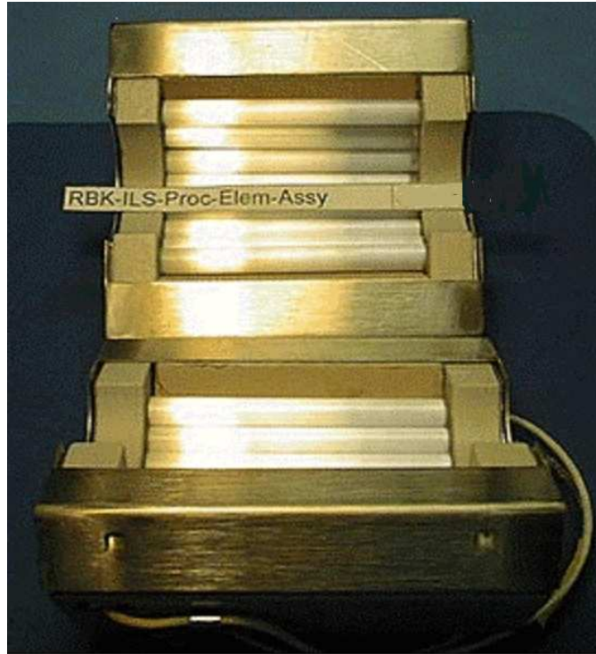
REPLACEMENT HEATING ELEMENT