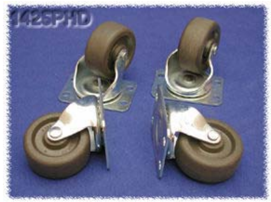
click to enlarge