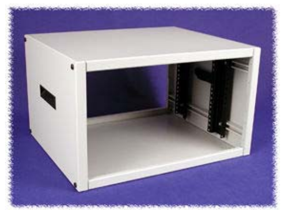
Textured - Light Gray (RAL7035) click to enlarge