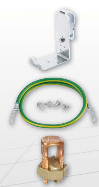
Step 5. Bond nearby conductive items, such as pathways, to the TGB