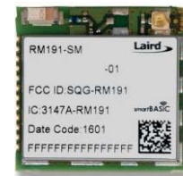
Actual Size (25.4mm x 25.4mm)

Support works onsite with Laird engineering to speed your design to market.