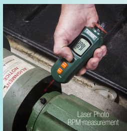
Laser Photo RPM measurement

Convenient pocket-sized combination tachometer, quickly measures RPM and Linear Surface Speed. Use the contact wheel for up-close readings or laser mode for safer, non-contact measurements up to 4.9ft (1.5m) away. Characters on display reverse direction depending on measurement mode used.