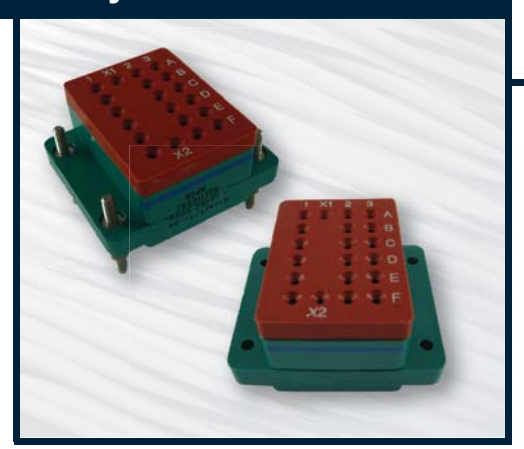
Mates with M83536, M83536 Relays