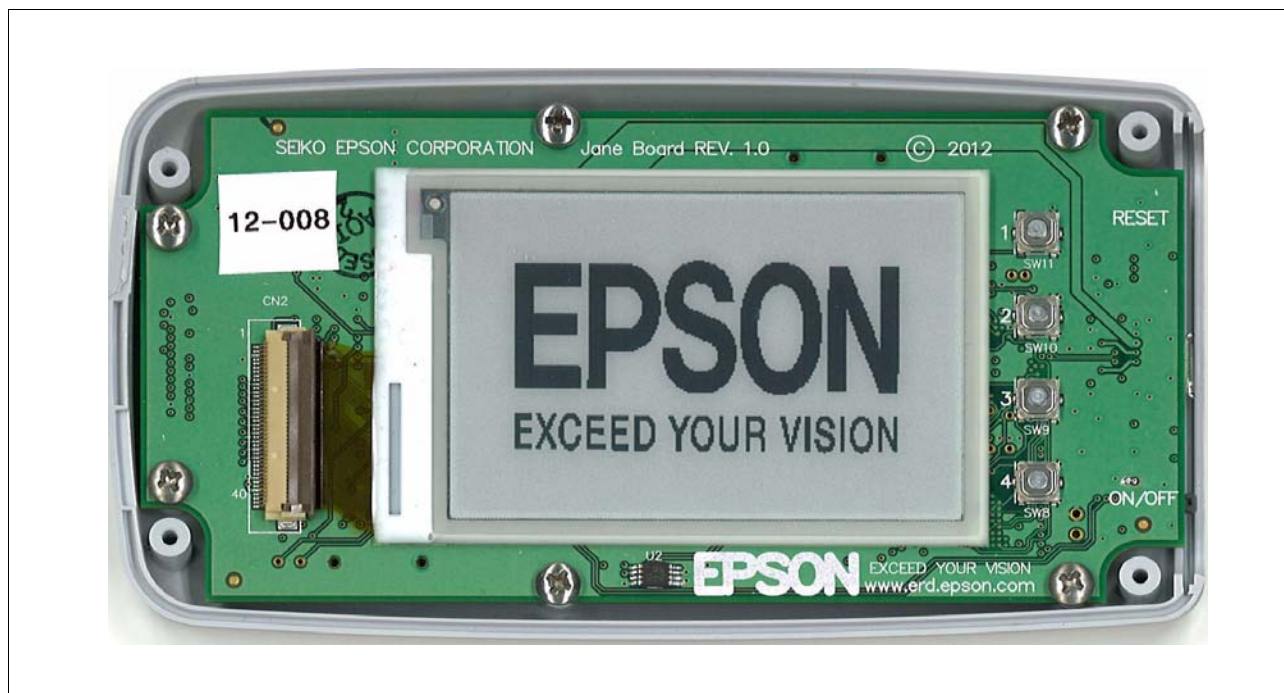
Figure 1-1: Jane-TCON EPD Demo Unit (Top View)

The unit is powered by an internal Li-Ion rechargeable battery or from a USB connection. The battery is charged by power from the USB connection. The unit has an Epson TCON, S1D13T03, and typically has mounted a 2.7" panel from PDI. The board can also use a 1.44" or 2" EPD panel from PDI. The main processor on the board is an Epson MCU, S1C17801, which has embedded an USB controller. The demos software, including the images are stored on a microSD card.