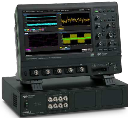
4 analog channel + 16 digital channel, 1 GHz, 12 bit resolution HDO6104A-MS high definition oscilloscope with SAM40-8 provides 4+16+8 channel acquisition capability.

Engineers commonly use multiple instruments to debug and validate complex deeply embedded control systems, mechatronics, and electro-mechanical systems. Multiple instruments report different information on different displays and in different formats. An HDO with a sensor acquisition module cost-effectively replaces multiple instruments with one consolidated view of system performance. Leverage the Teledyne LeCroy deep toolbox to perform math, measurements, pass/fail and other analysis on all acquired data, or apply an application package to gain even faster time to insight.