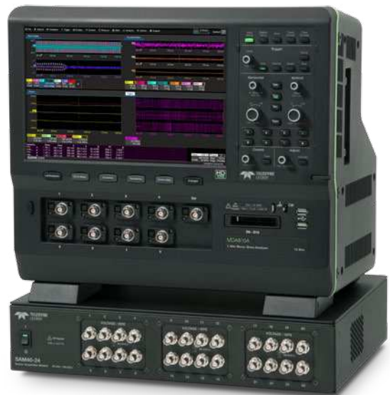
8 analog channel + 16 digital channel, 1 GHz, 12 bit resolution HDO8108 high definition oscilloscope with SAM40-24 provides 8+16+24 channel acquisition capability.

The most basic system available combines a 350 MHz, 500 MHz, or 1 GHz 12-bit resolution, 4 channel oscilloscope (HDO4000A or HDO6000A Series) with a SAM40-8 eight channel acquisition module. This triples the number of available inputs for a very modest price, and preserves high bandwidth oscilloscope inputs for the most important uses, or provides capability to view more high bandwidth signals than would have previously been possible without the SAM40. 16 and 24 channel acquisition modules may also be used. MSO oscilloscope models further add 16 digital logic input channels.