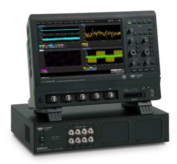
4 analog channel + 16 digital channel, 1 GHz, 12 bit resolution HD06104A-MS high definition oscilloscope with SAM40-8 provides 4+16+8 channel acquisition capability.

Engineers commonly use multiple instruments to debug and validate complex deeply embedded control systems, mechatronics, and electro-mechanical systems. Multiple instruments report different information on different displays and in different formats. An HDO with a sensor acquisition module cost-effectively replaces multiple instruments with one consolidated view of system performance. Leverage the Teledyne LeCroy deep toolbox to perform math, measurements, pass/fail and other analysis on all acquired data, or apply an application package to gain even faster time to insight.