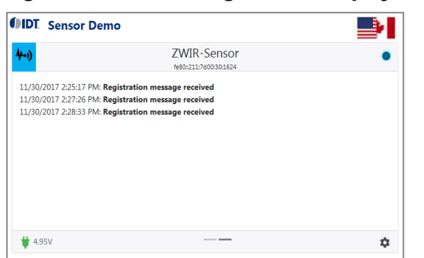
Figure 6. Browser Registration Display Example

The browser logs the date and time when the Sensor Cube is linked to the Hub. The example shows the Cube was turned off and on, resulting in three different registrations. This history is reset when the browser is terminated.