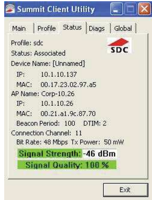
SCU is a graphical utility for configuration, troubleshooting, and management