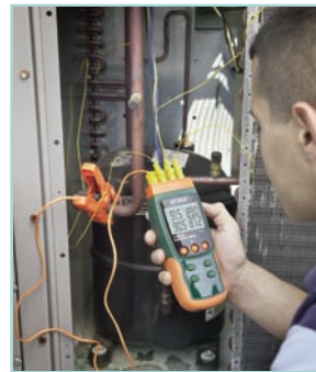
Simultaneously measures 4 temperature inputs for multiple source monitoring