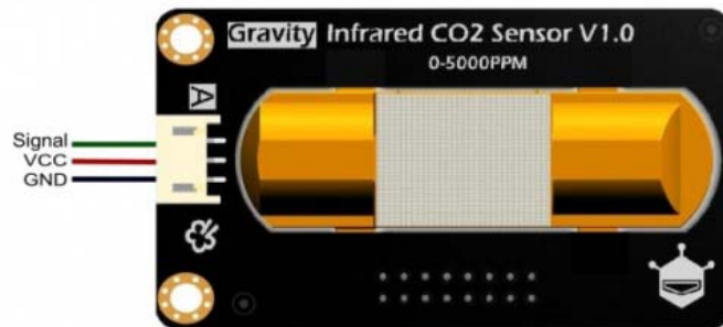
SEN0219 CO2 Sensor