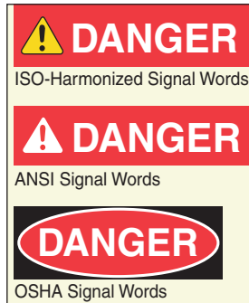
ANSI, OSHA, and ISO Signal Words