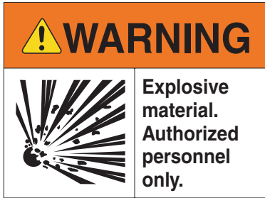
3,400 Predefined Safety Signs