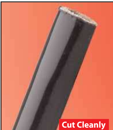
Cut Cleanly Scissors

SF sleeving is rated to 392°F. (Class H), is abrasion resistant, and maintains it's flexibility in low temperature environments. It is available in a very wide range of sizes, and is ideal for use in appliance assemblies, wire harnesses, transformer leads, power supplies, motor coil and heater leads.