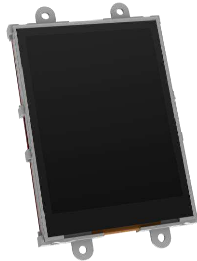
The uLCD-28-PTU Display Module