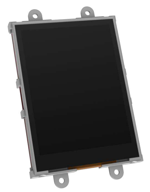
The uLCD-28-PTU Display Module