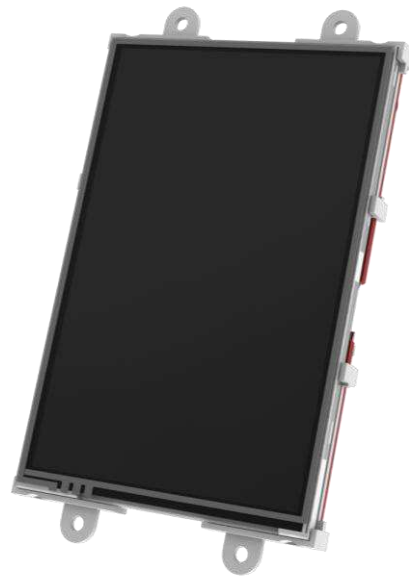
The uLCD-35DT Display Module

NOTE (*): Arduino remains the property of the Arduino Team. All references to the word Arduino and Arduino Hardware are licensed under the Creative Commons Attribution Share-Alike license.