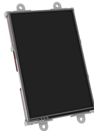
The uLCD-35DT Display Module