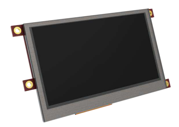
The uLCD-43PT Display Module