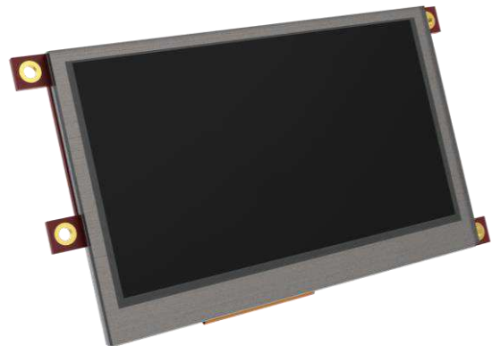
The uLCD-43-PT Display Module