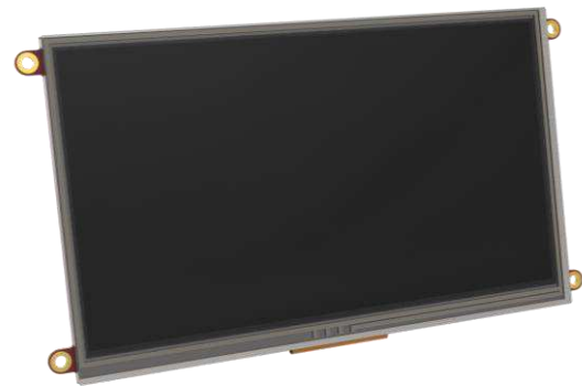
The uLCD-70DT Display Module