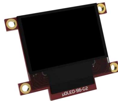
The uOLED-96-G2 Display Module

NOTE (*): Arduino remains the property of the Arduino Team. All references to the word Arduino and Arduino Hardware are licensed under the Creative Commons Attribution Share-Alike license.