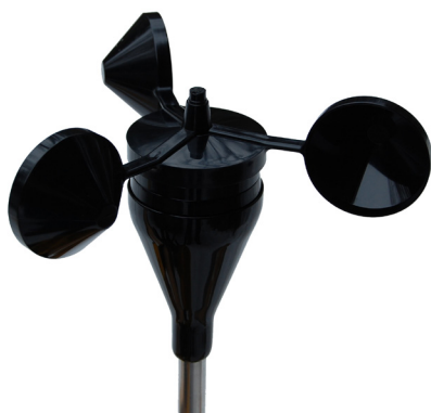
Three Cup Anemometer

The SLT converts the frequency of an anemometer signal to a 4-20 mA signal. The SLT anemometer is UV stabilized black polycarbonate. The 4-20 mA transmitter board is track mounted and powered by the milliamp loop. The wind speed range is 0-100 MPH over the 4-20 mA output.