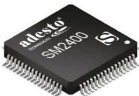
Figure 1. SM2400 N-PLC Transceiver