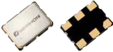
7.0 x 5.0mm Ceramic SMD