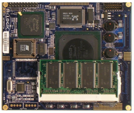
AMD GEODE LX 800 SOM-ETX

The AMD Geode LX 800 SOM-ETX is ideal for applications in the medical, point-of-sale, gaming, industrial, and security markets. From patient monitoring and medical imaging, to card payment