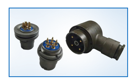
Military Audio /Power