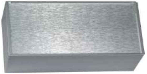
Model: W30-66-46B - closed