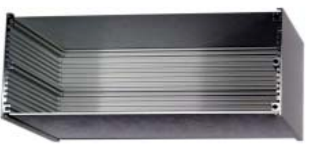
Model: W30-66-46B - open