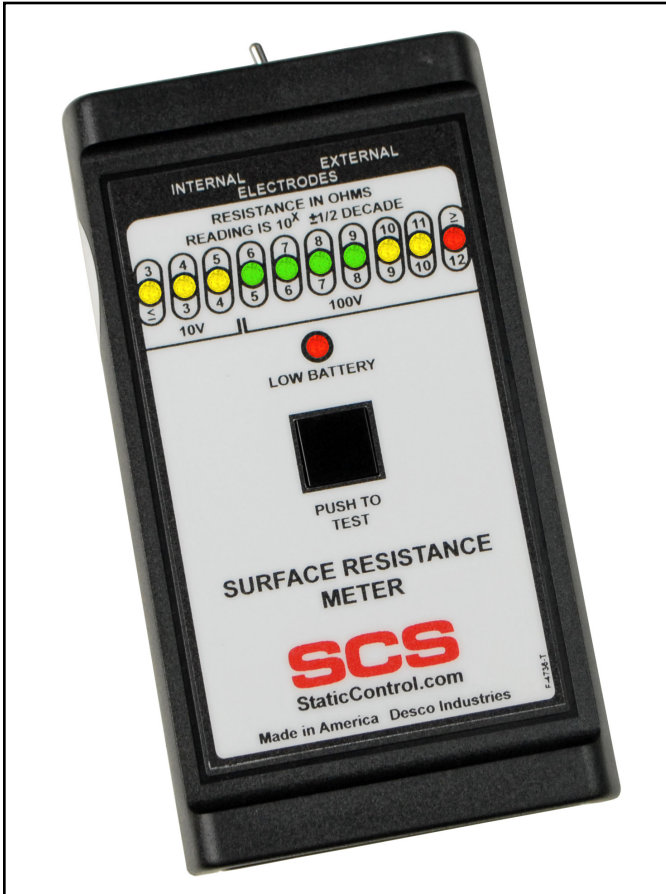
Figure 1. SCS SRMETER2