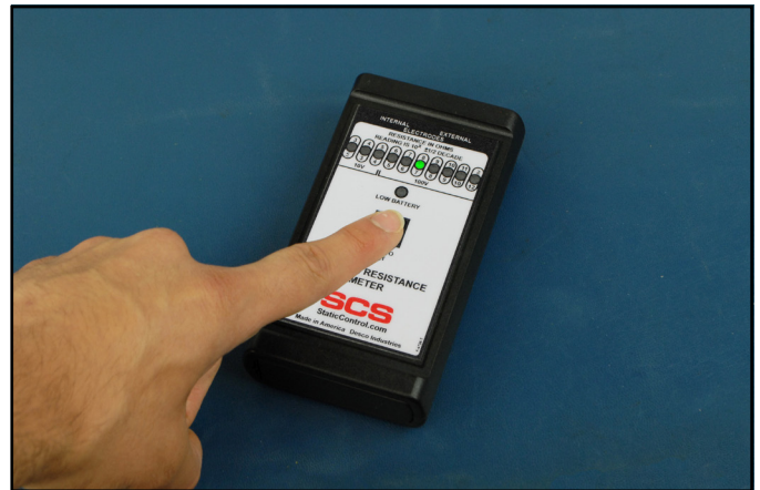
Figure 3. Using the parallel electrodes to measure surface resistance

If the measurement is outside acceptable limits, clean the surface with an ESD cleaner containing no insulative silicone such as Charge Guard™ Mat Cleaner, and re-test to determine if the cause of failure is an insulative dirt layer or the ESD worksurface material.