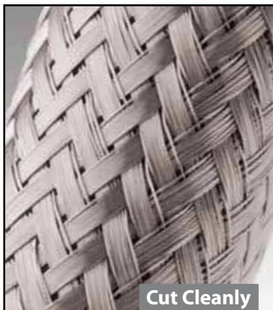
Cut Cleanly Shears