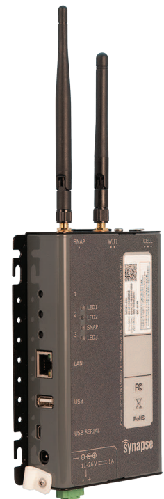
SS420 Site Controller