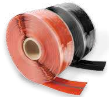
Colored guide line only on TGL (Triangular Guide Line) tapes.