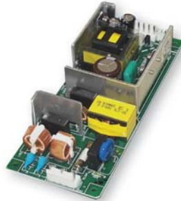
SWF100P-24 100 W