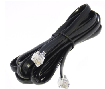
WX connection cable