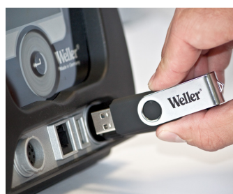
Multi-purpose USB port