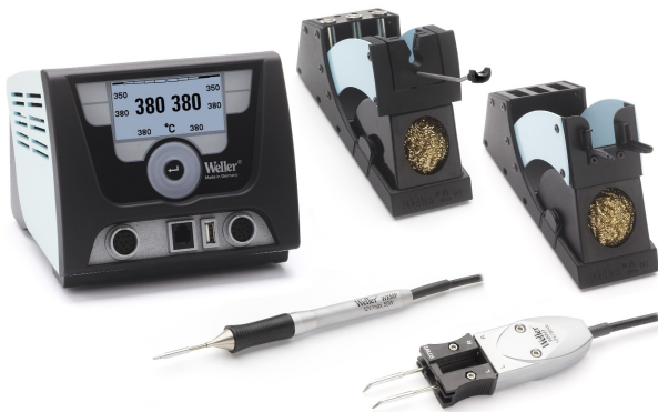
WX 2 soldering station WXMP Micro soldering iron & WXMT Micro tweezer