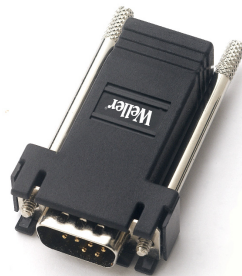
WX Adapter for WFE / WHP