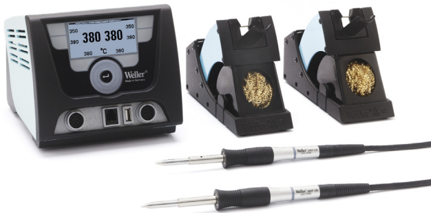
WX 2 soldering station with 2 WXP 120 soldering irons