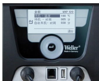
Multiple language menu navigation