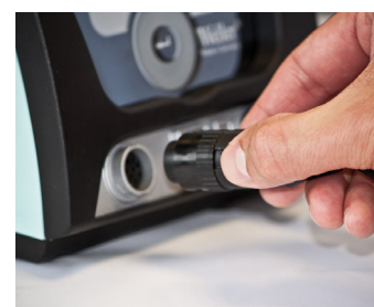
WX tool connection