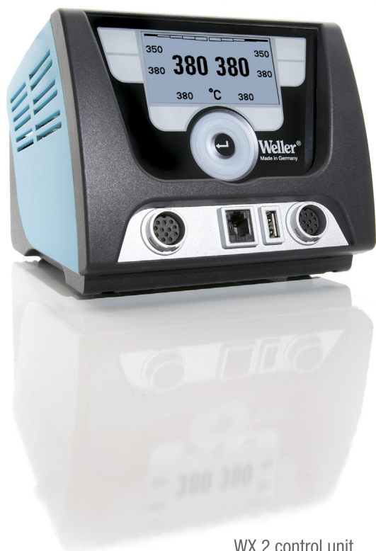
WX 2 control unit