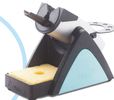
WT1010 Set pictured.

The unique, reversible WSR safety rest flips between sponge and brass wool.