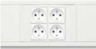
45x45 Modules (French) shown in T130FFMC.*