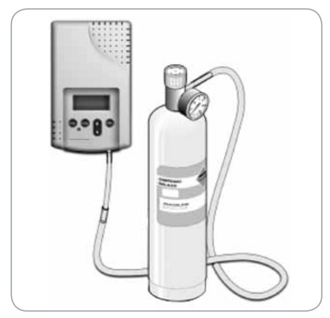
The illustration shows the complete set-up for calibrating a sensor with display.

*Nitrogen gas not included. Requires disposable gas tank: CGA600, 99.95% Nitrogen 20 bar fill pressure, approximately one liter.