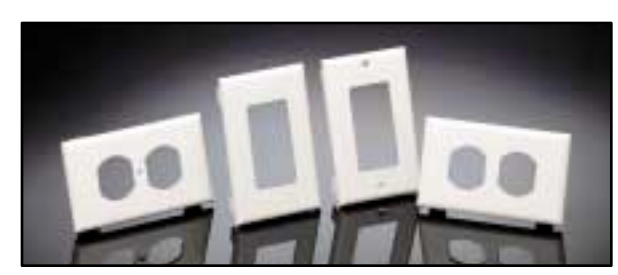
PAN-WAY Snap-On Faceplates

Electrical/Communication Faceplates . . . . . . A3 Electrical/Communication Faceplates (with screw holes to mount a module frame) . A3