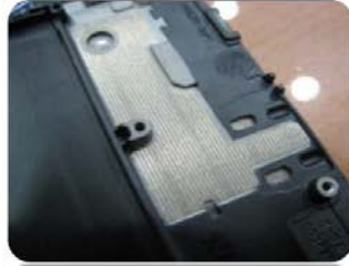
Mobile Middle Case