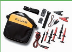
TLK289 Electronic Test Lead Kit