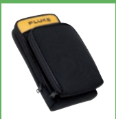
C781 Soft Meter Case