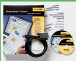
FlukeView® Forms Software and Cable

A wide array of accessories is available to help you maximize the productivity of the Fluke 289 but the following are essential for most users.