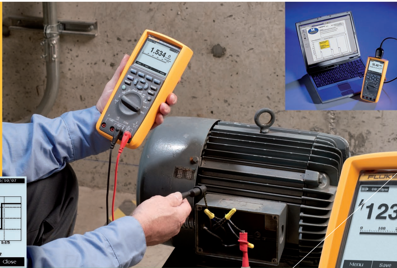
Transfer data to PC using optional cable and FlukeView Forms Software