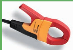
i400 Current Clamp

For more information on how the Fluke 289 True-rms Industrial Logging Multimeter with TrendCapture can help you, go to www.fluke.com/289 .