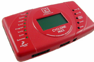
Figure 8-2: P&E's Cyclone MAX