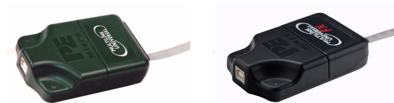
Figure 8-1: Multilink Universal (left) & Multilink Universal FX (right)