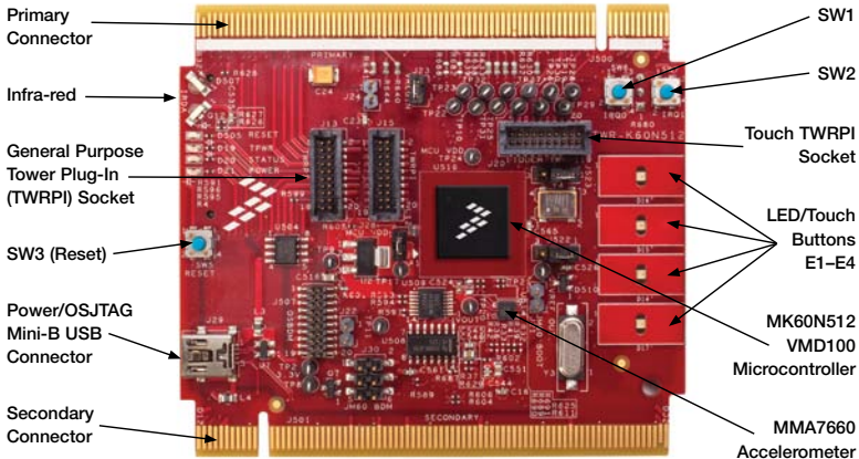
Figure 1: Front Side of TWR-K60N512 Module Not Including TWRPI.