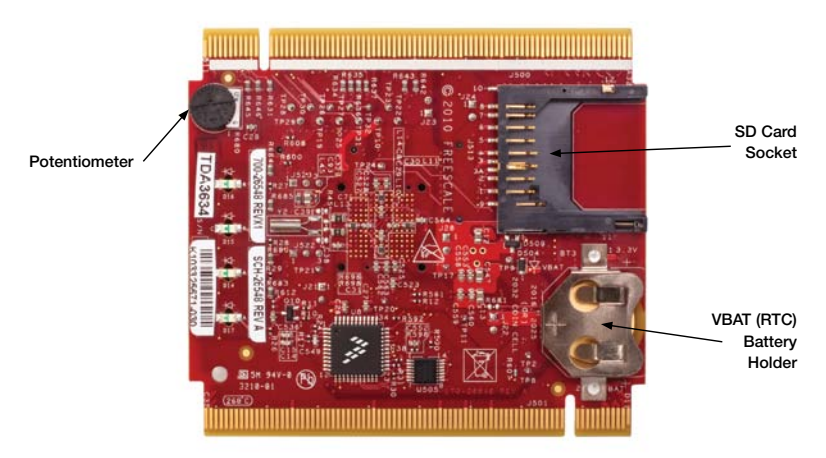
Figure 2: Back Side of TWR-K60N512 Module.