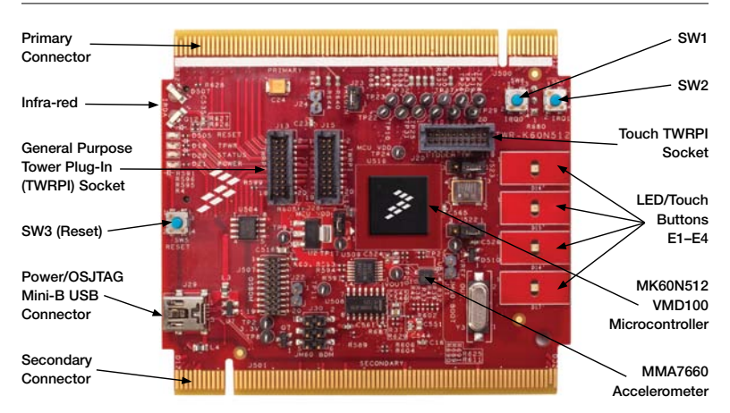
Figure 1: Front Side of TWR-K60N512 Module Not Including TWRPI.