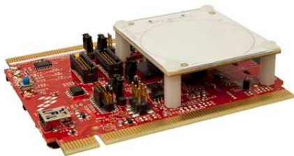
*Tower System module not included with TWRPI-ROTARY plug-in