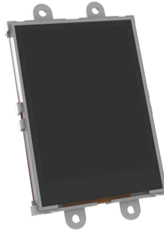
The uLCD-24-PTU Display Module