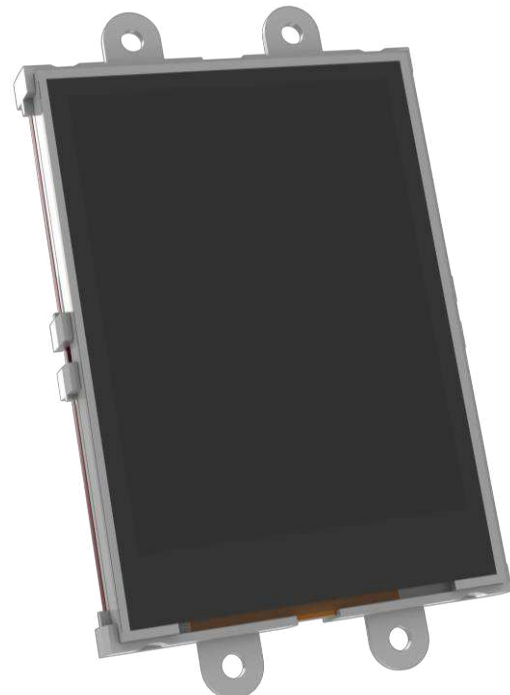
The uLCD-24-PTU Display Module